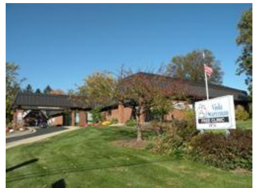
The Viola Startzman Free Clinic (VSFC) is the only free clinic in Wayne County and the 3 rd largest in the state of Ohio. Since 1995, VSFC has provided high-quality comprehensive health and dental care, wellness education, medications, and related health services at no charge to low-income uninsured Wayne County residents.

Grant guidelines and application forms are available at the Foundation or on our website. Donations to Community Funds by individuals, families, businesses and service organizations allow for greater future grant opportunities.